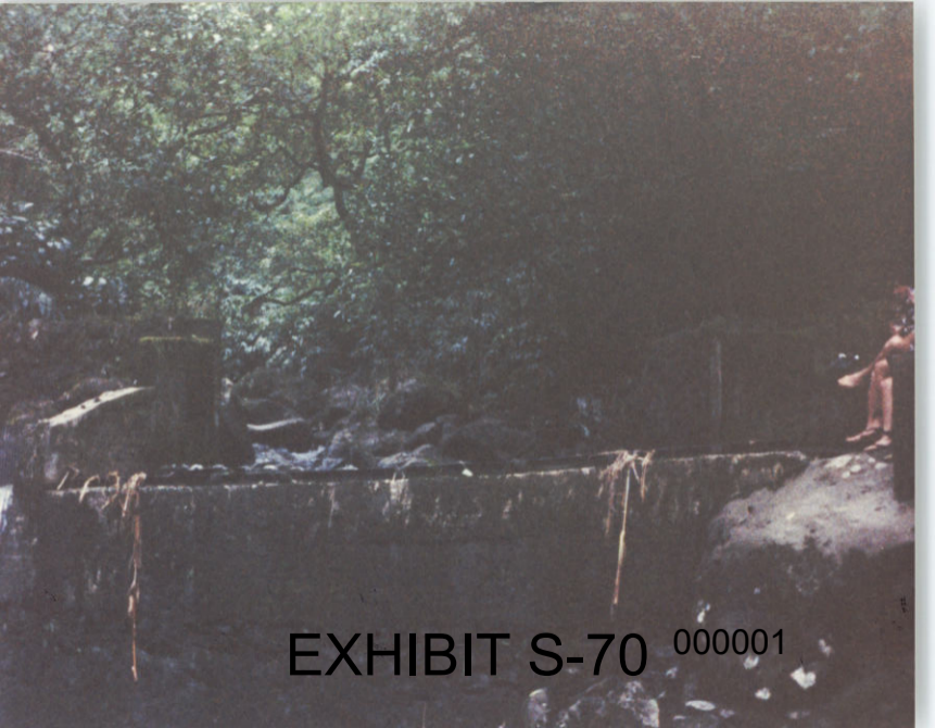
EXHIBIT S-70 000001